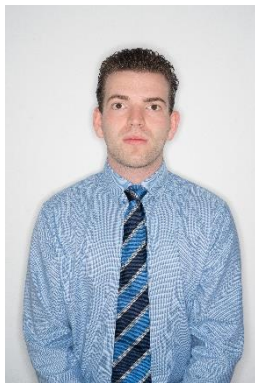
Fig.: Hohloh